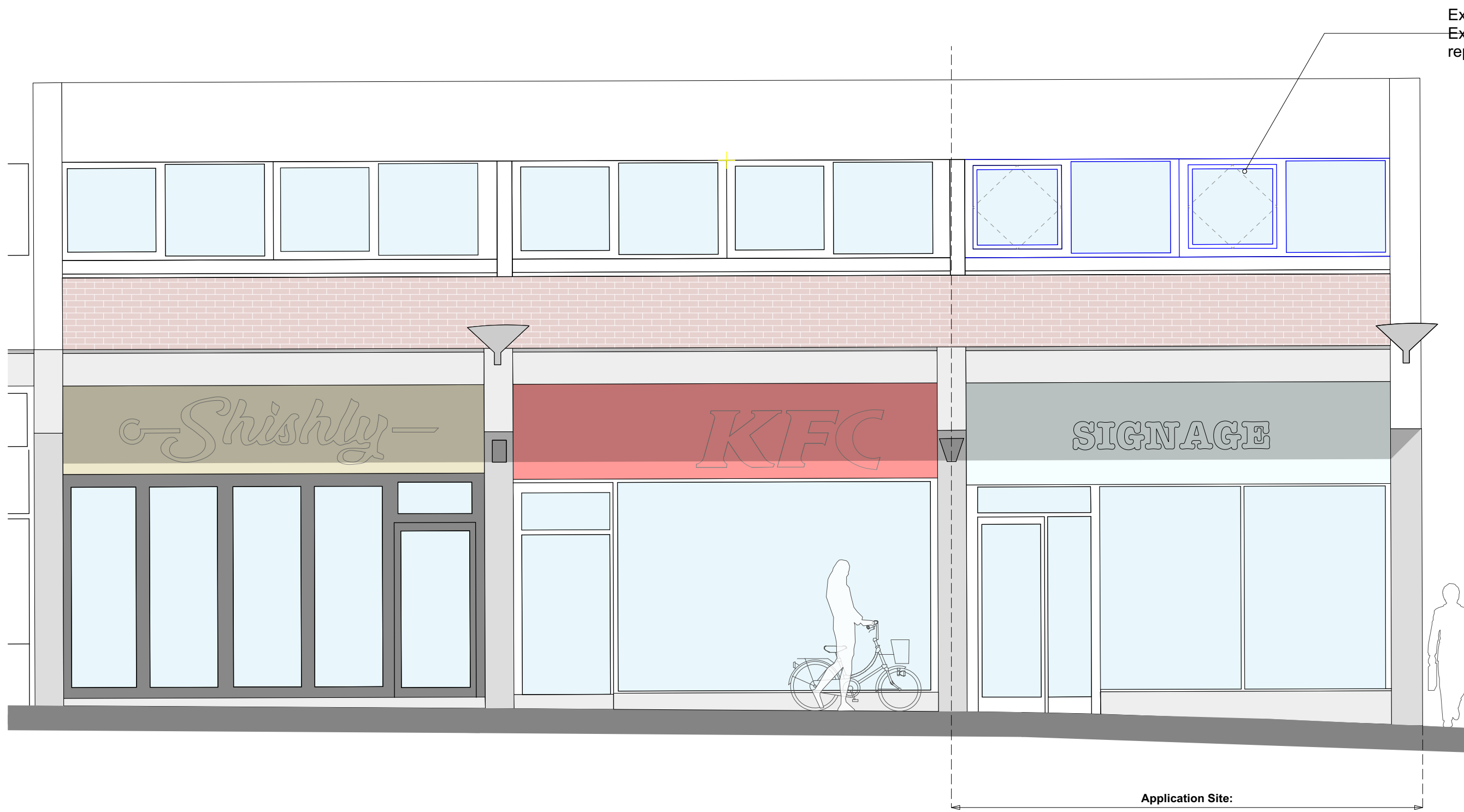
6 Elevation AA (Northeast) Scale: 1:50