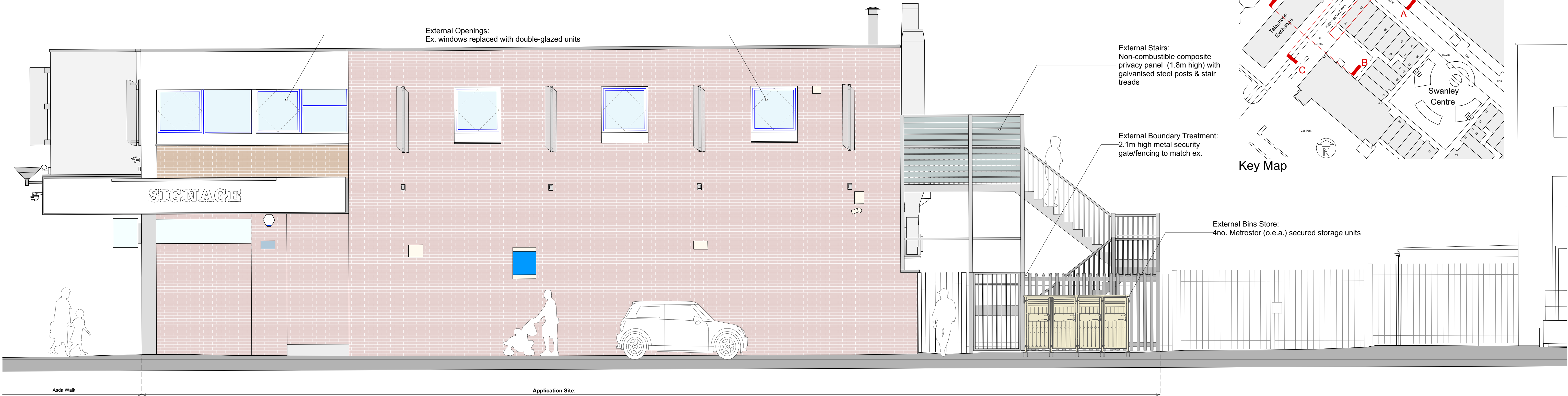
8 Elevation CC (Northwest) Scale: 1:50