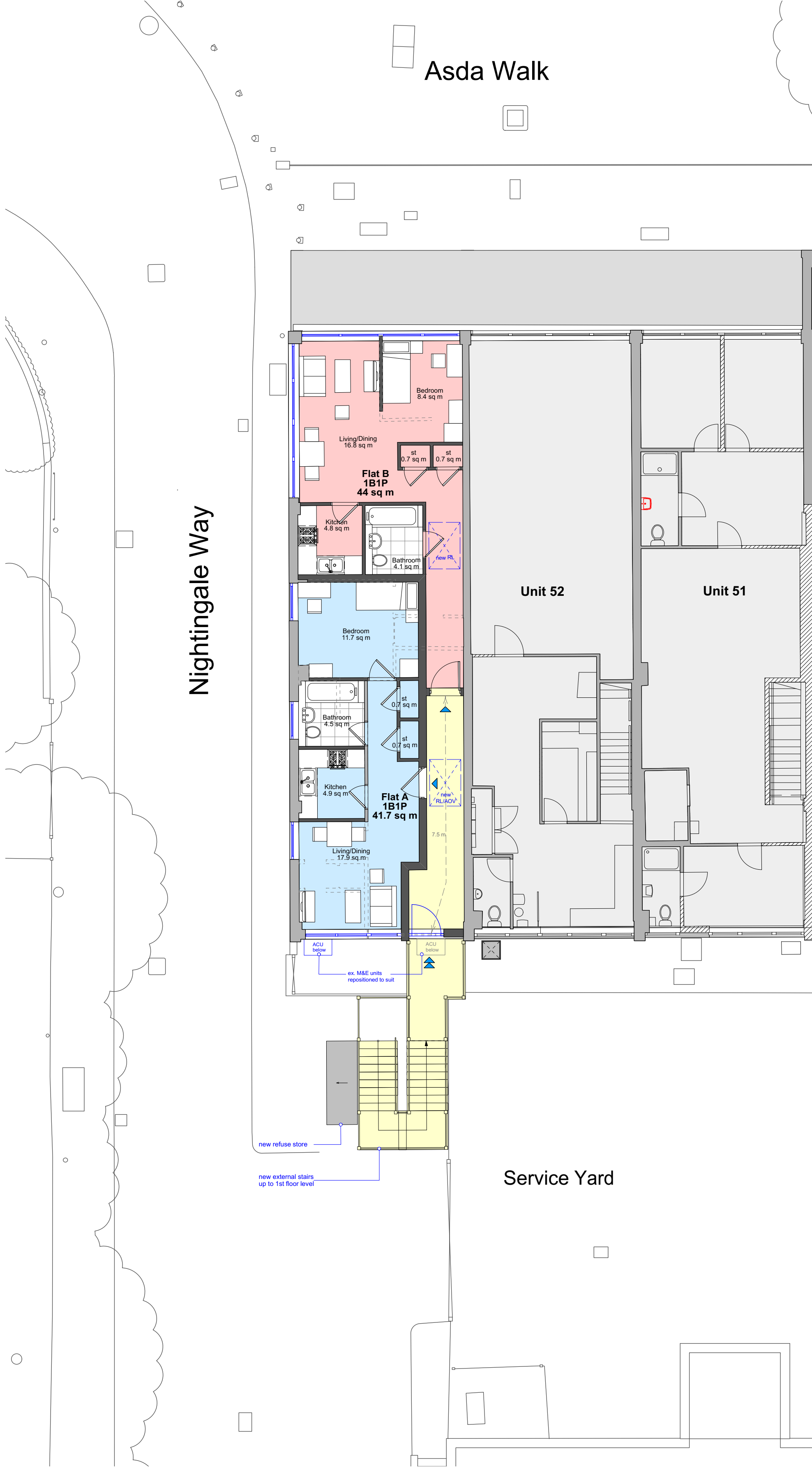
4 First Floor Scale: 1:100