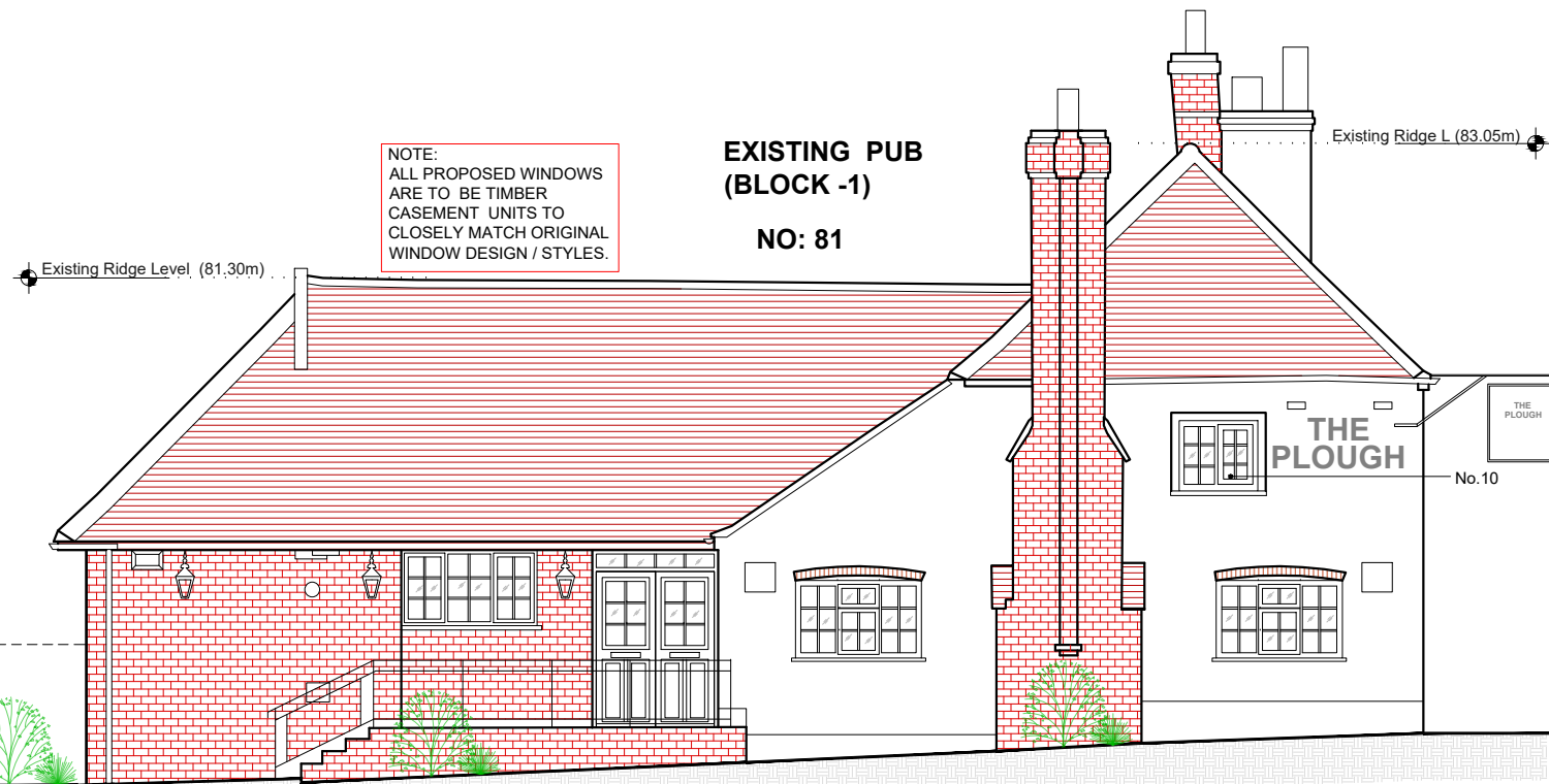
PROPOSED SIDE (EAST) ELEVATION