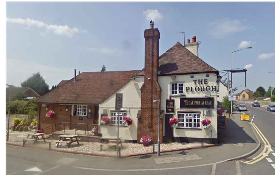
GOOGLE PHOTO - 2009